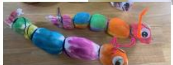
SOCK CATERPILLAR Craft for Kids

Free booklet with all the instructions, so that you can continue making the crafts when you get home!